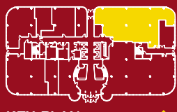
KEY PLAN 1ST FLOOR